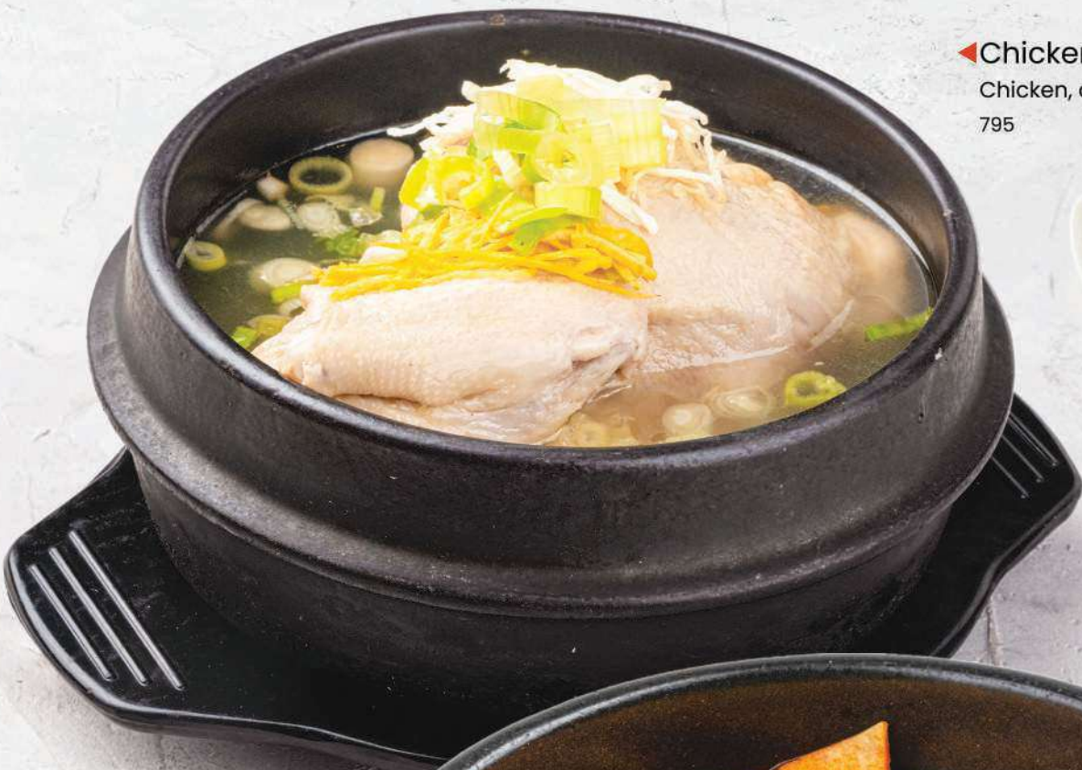
◀Chicken Ginseng Chicken, onion leeks, and jidan 795