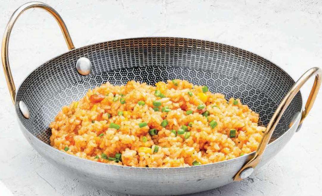
▲ Korean Stir Fried Rice Korean stir-fried rice, mixed vegetables, and Korean luncheon meat 185