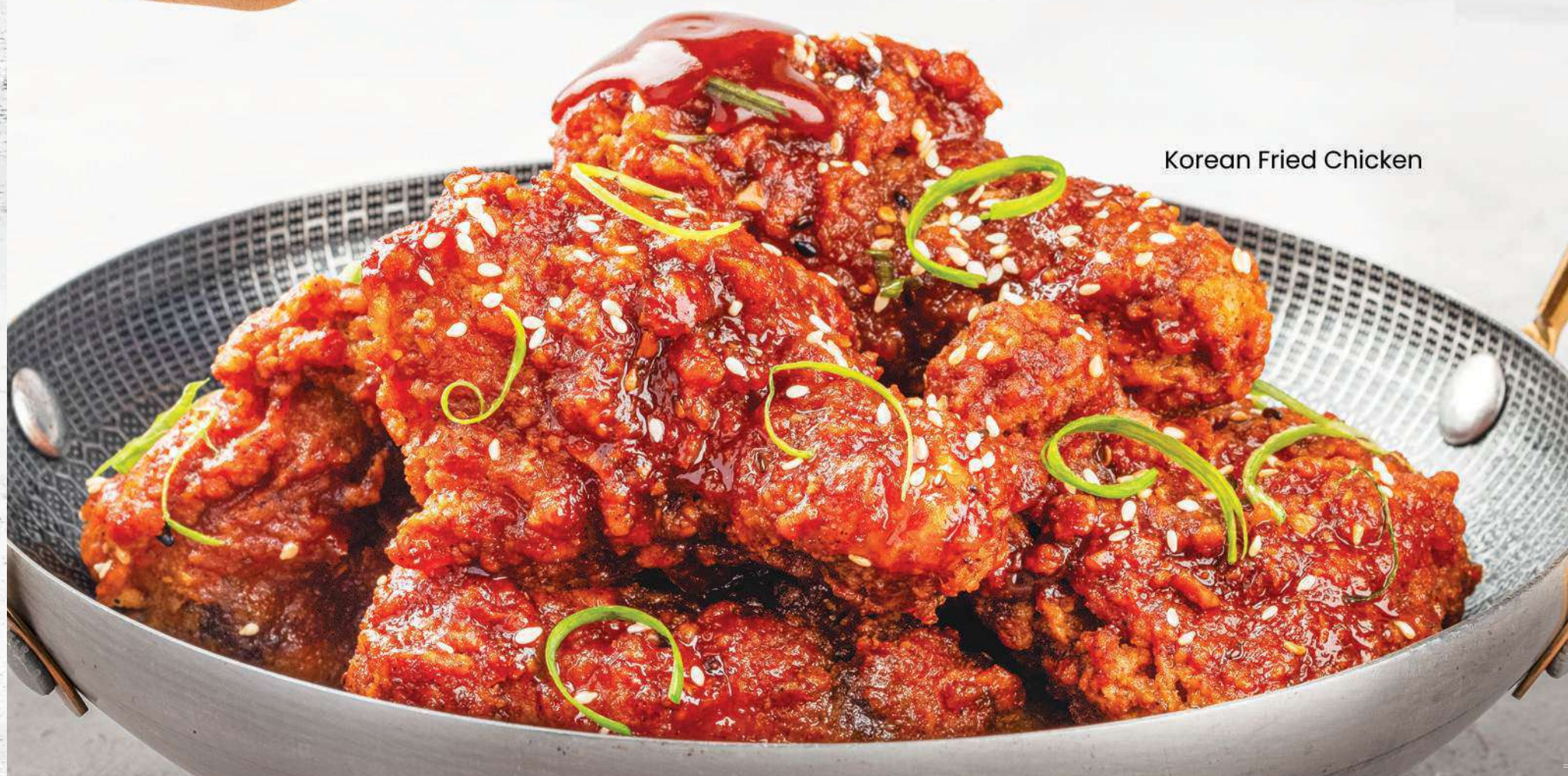
Korean Fried Chicken

Korean specialties are a delightful blend of flavors and textures that reflect the rich culinary traditions of the region. These snacks often balance savory, sweet, and spicy elements, providing an exciting taste experience. From crispy and crunchy bites to chewy and satisfying treats, Korean snacks are perfect for sharing and enjoying in social settings, making them beloved staples in everyday life.