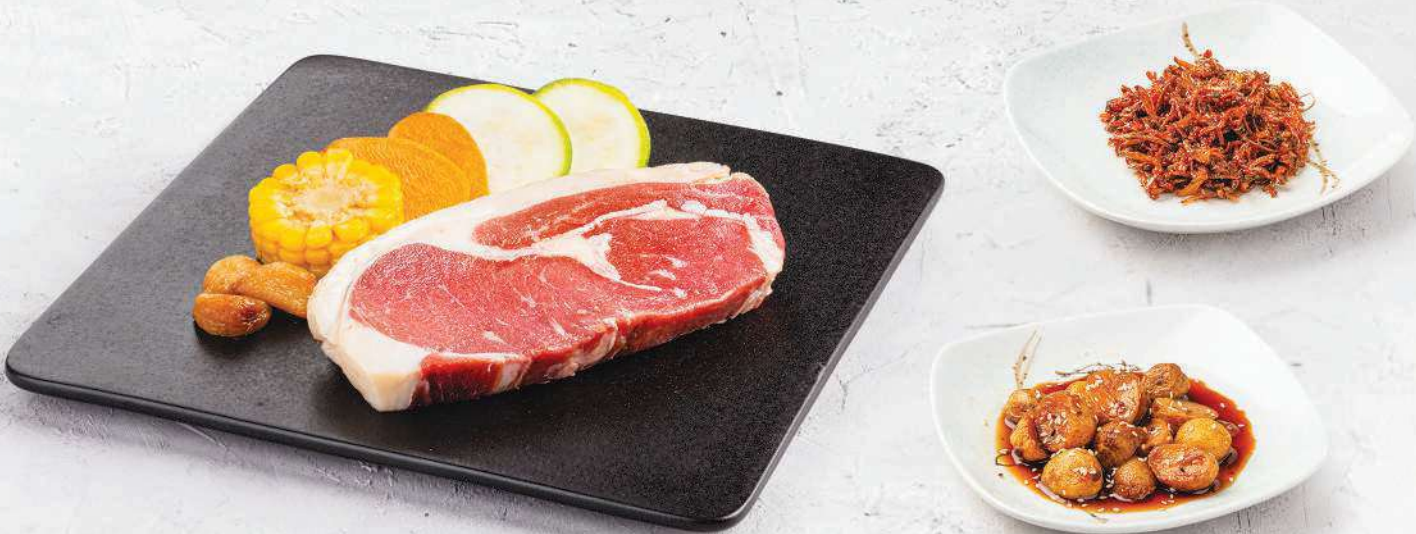
▲ 8oz NY Steak Good for 1-2 persons 995