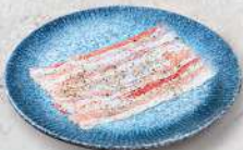
Salt & Pepper