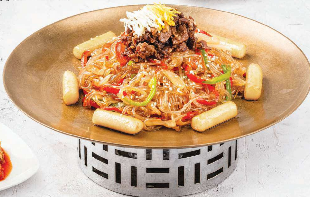
▲ Korean Japchae Glass noodles, beef, korean rice cake, red and green bell peppers, and onions 450