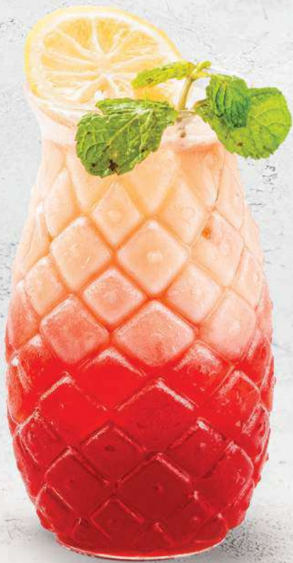
▲ Tropical Hibiscus Hibiscus, yogurt, and lemon 185

Prices are VAT inclusive and are subject to 10% service charge.