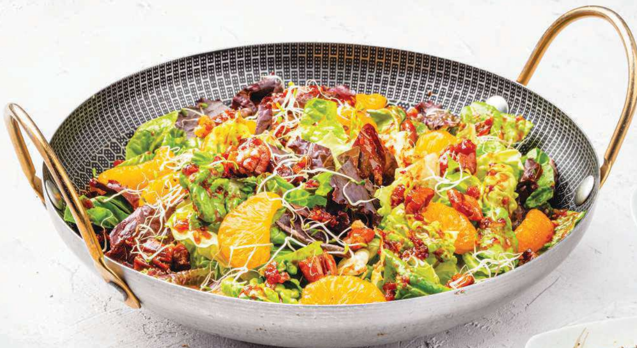
▲ Bulgogi Salad Mixed greens, spicy Korean dressing mandarin orange, and glazed pecan Add beef bulgogi +95 195 | 395