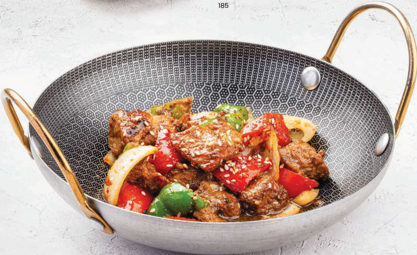
◀ Korean Style Pork BBQ Pork shoulder BBQ and sweet & spicy sauce 395 | 705