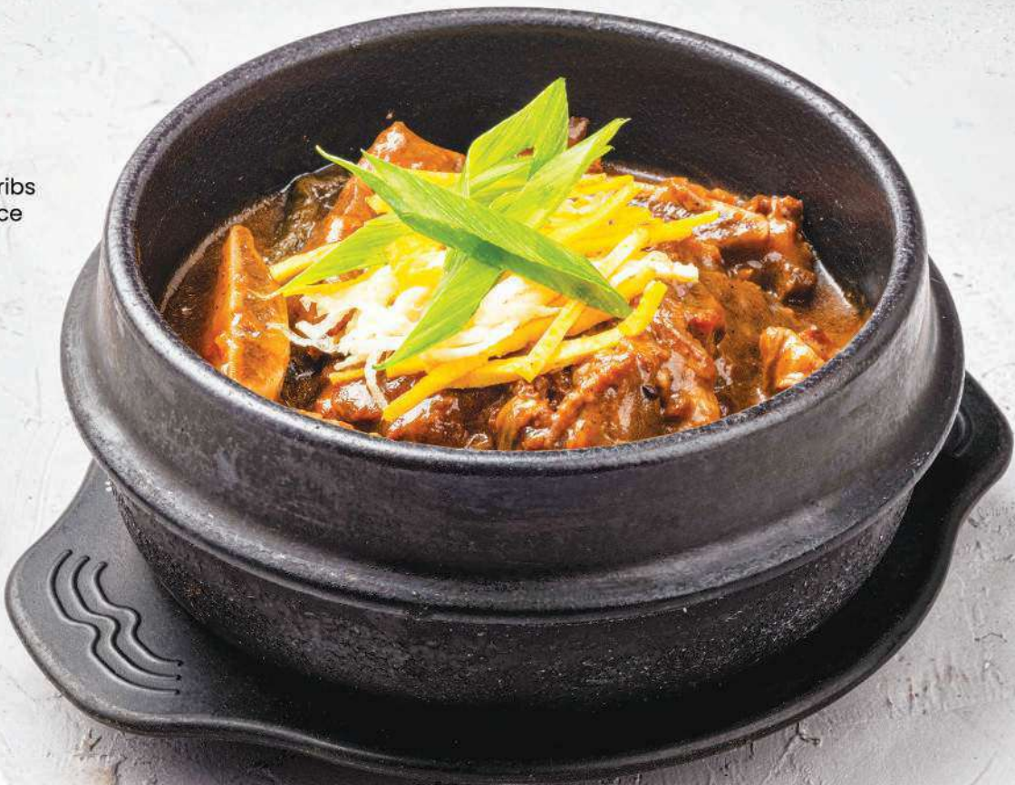
► Galbi Jim Braised beef short ribs and sweet soy sauce 385 | 795