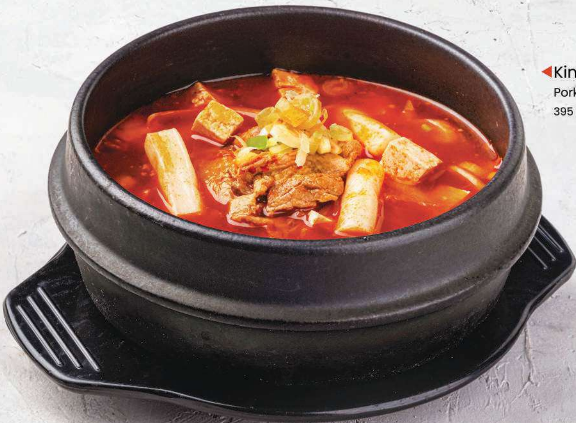
◀ Kimchi Stew Pork, rice cake, and tofu 395 | 775