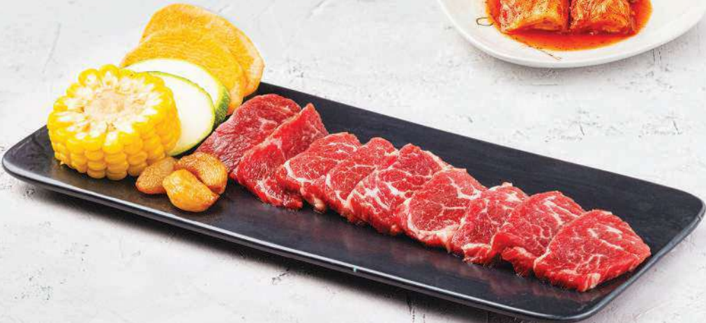
◀ USDA Marinated Boneless Short Ribs Good for 1-2 persons Boneless short ribs BBQ and Bulgogi sauce 995