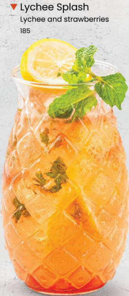
▼ Lychee Splash Lychee and strawberries 185