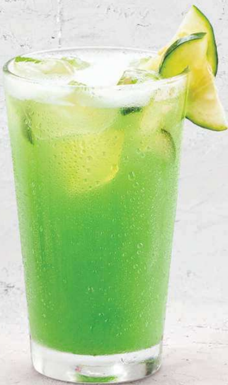
▲ Tropical Three Pineapple, blue lemonade, cucumber, and lemon lime soda 195