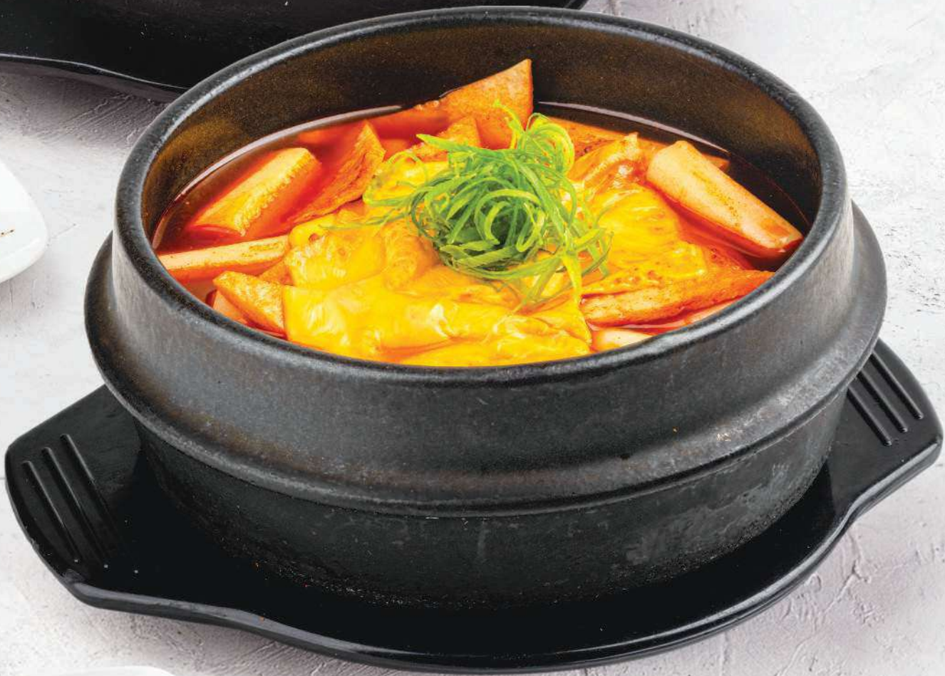
▲Cheezy Tteok-bokki Soup Sweet and spicy soup with chewy Korean rice cake, Korean fish cake, and cheddar cheese 385