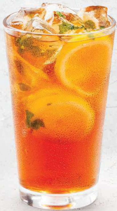
◀ Plum-A-Day Plums, mint, lemonade, and lemon lime soda 195