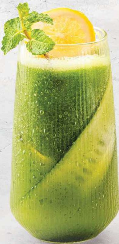
▲ Green Tea Cooler Green tea, cucumber, and lemon 185