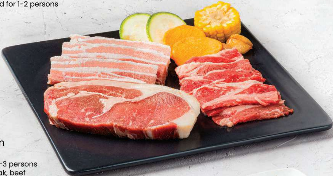
▶ Premium BBQ Trio Good for 2-3 persons 8oz NY steak, beef belly, and pork belly 1595